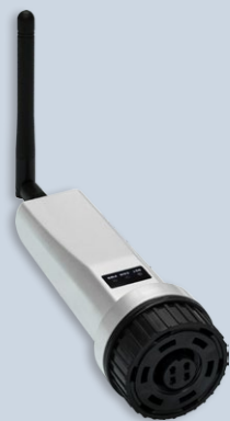
Data Logging Stick S3-WiFi-ST