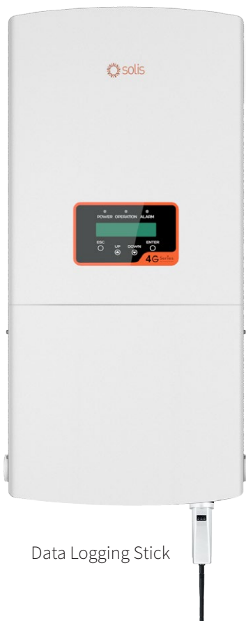
Data Logging Stick